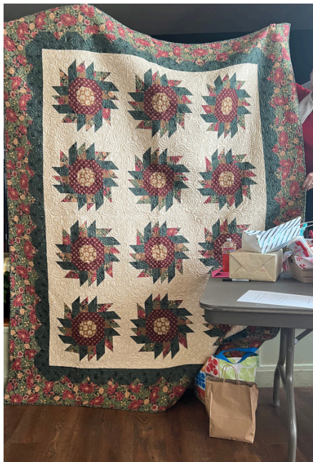
SUE'S WHIRLWIND IN MEMORY OF Sue Sampath